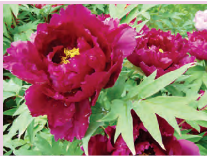
Last year's beauties

Some visitors are not familiar with how these beautiful flowers came to grace our park. When the tragedy of September 11th occurred, a town in Shimane Prefecture, Japan wanted to express a gesture of healing and solidarity towards the United States. Therefore, they sent the Rockefeller State Park Preserve and the Brooklyn Botanic Garden a gift of 500 peonies each from Yatsuka Cho. The peony is the signature flower from this area and is considered Japan's "most noble of flowers."