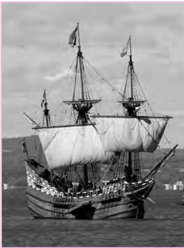
A replica of Henry Hudson's Half Moon sails on the Hudson River near West Point, NY

Four hundred years ago, Henry Hudson and his crew sailed the Half Moon into New York Harbor and up the river where he undoubtedly gazed starboard up at Rockwood Hall and the Rockefeller State Park Preserve.